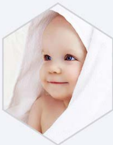
Body Temperature Measurement

Support frontal temperature, object temperature mode measurement, multi-function use