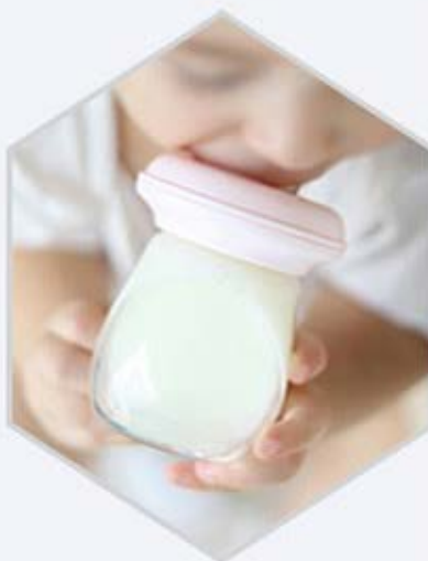
Object Temperature Measurement